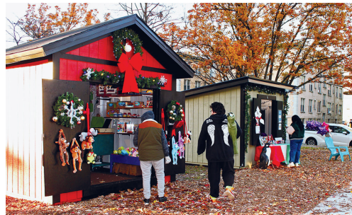
Kringle Holiday Market brings seasonal outdoor shopping