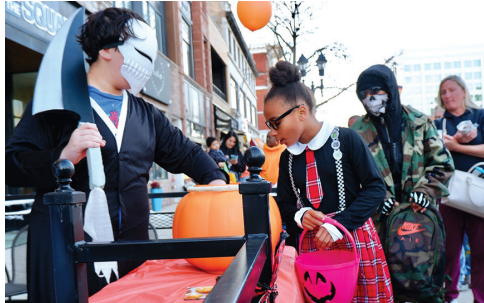
Trick or Treat on the Square

Sparrow Bloom adds to shopportunities downtown