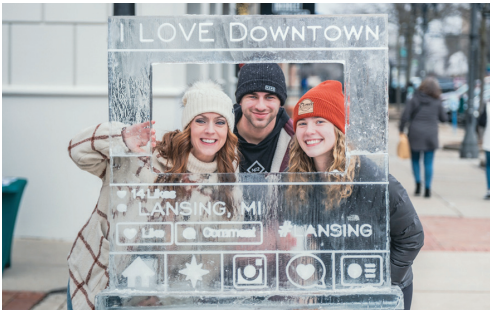
Year-round events fuel passion and pride!