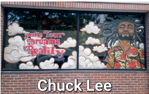
Local art beautifies our community.

“At DLI we are privileged to work collaboratively with our stakeholders to set the vision and strategic plan for the future of Downtown Lansing. Let’s pave the way for growth, vibrancy, and a downtown where everyone can thrive together!”