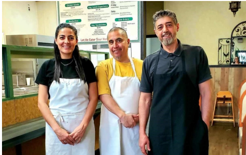
Over $1.8 million in Small Business Grants uplifted downtown businesses.