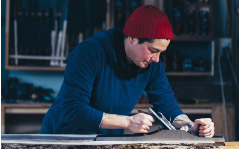
Nine new businesses opened in 2024, diversifying the downtown experience.