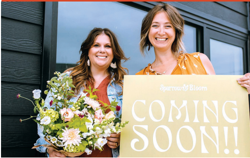
Sparrow Bloom adds to shopopportunities downtown