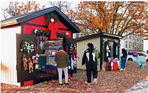
Kringle Holiday Market brings seasonal outdoor shopping