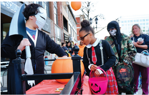
Trick or Treat on the Square